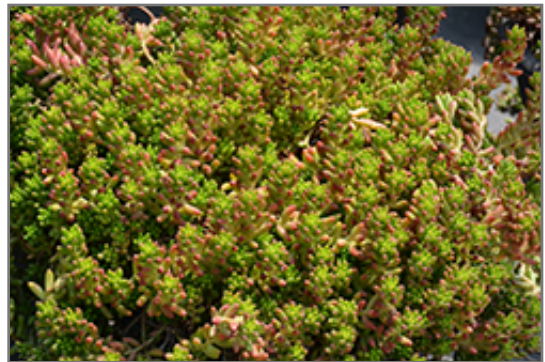
Jelly Bean Plant